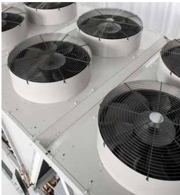
Quiet AeroAcoustic® fan system

For applications that require the unit to quickly recover after a power supply interruption, the 30XV has you covered. Plus, it's more than a quick restart. The 30XV is able to recover to its full cooling capacity within four minutes after the interruption.