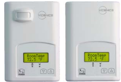
Fig.1 - VT7200 Series

Typical applications include local hydronic reheat valve control and pressure dependent VAV with or without local reheat. The product features a backlit LCD display with dedicated function menu keys for simple operation. Accurate temperature control is achieved due to the product's PI proportional control algorithm, which virtually eliminates temperature offset associated with traditional, differential-based thermostats. Models are available for 3 point floating and analog 0 to 10 Vdc control. In addition remote room sensing is available.