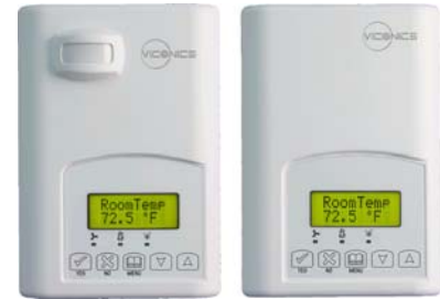
Fig.1 - VT7600 Series

All models contain two digital inputs, which can be set by the user to monitor filter status, activate a remote temporary occupancy switch, and/or used as a general purpose service indicator. In addition, depending on the model, up to three remote sensor inputs are available. All models contain a SPST auxiliary switch, which can be used to control lighting or disable the economizer function and a discharge air sensor input. For more advanced applications, an economizer control logic has been integrated onto the thermostat for use with proportional damper economizer actuators.