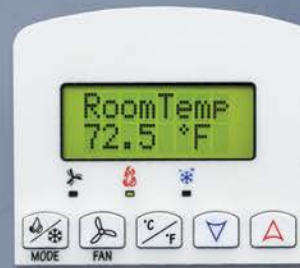
Hotel and Lodging Application