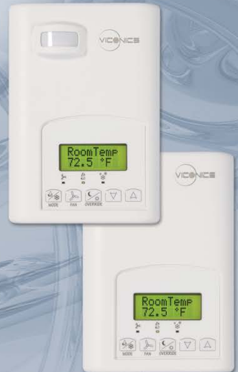
Commercial model shown