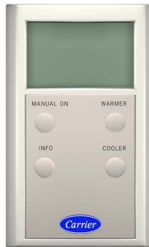
SPT Pro part# SPP