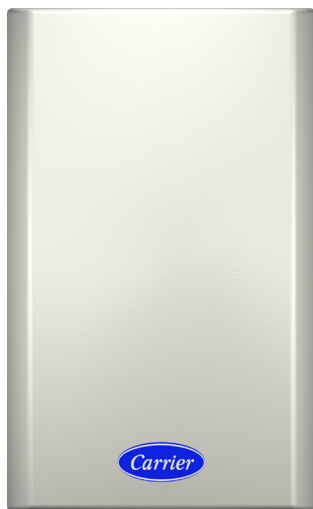
SPT Standard part# SPS

Carrier's intelligent line of SPT sensors are designed for use with any of the new Open line of Carrier controllers. These new sensors feature an attractive, low profile enclosure and a neutral color that complements any room. The SPT sensors are available in four different flavors, depending on your application needs. All SPT sensors provide a precise 10k thermistor and communication capabilities. In addition, they also feature a hidden communication port that provides easy access to the connected equipment for commissioning and maintenance.