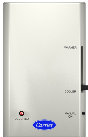
SPT Plus part# SPPL