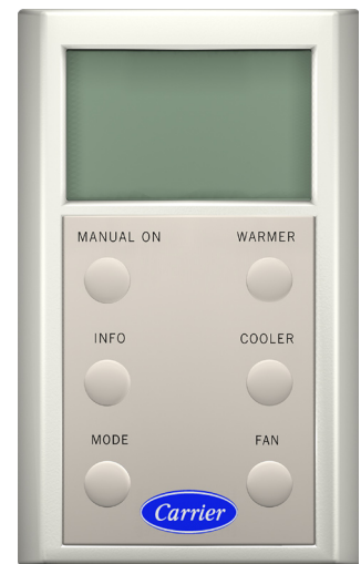
SPT Pro+ part# SPPF