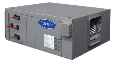
Constant Volume AHU